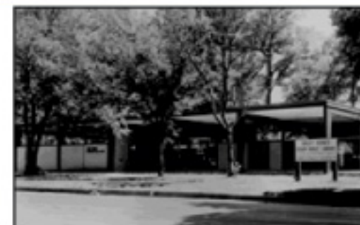
June 26, 1955 - The new Ensley Branch opened at 25th Street and Avenue L in a corner of Ensley Park. The ultra-modern building offered air conditioning, a meeting room, and a children's area.