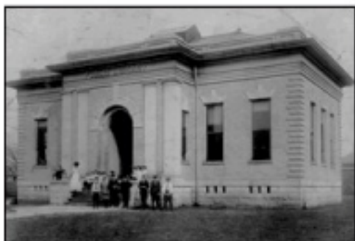
July 12, 1906 - The Carnegie Library of Ensley opened on the corner of Avenue H and 18th Street.

• TCI donated technical books, and the Ensley Land Company gave subscriptions to magazines and newspapers.